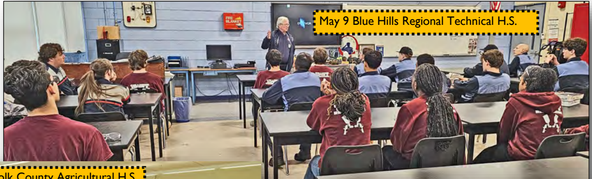
May 9 Blue Hills Regional Technical H.S.