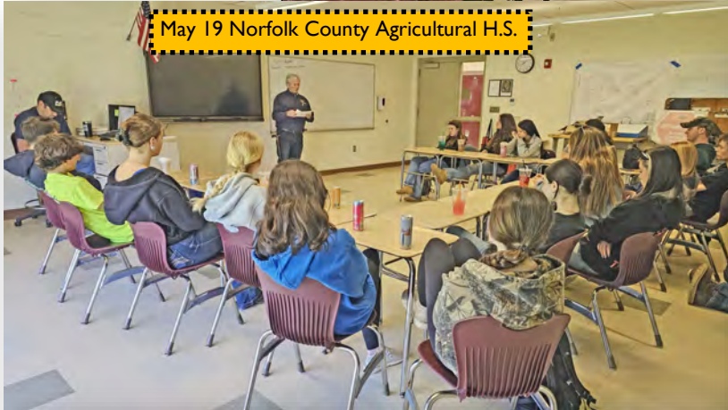
May 19 Norfolk County Agricultural H.S.