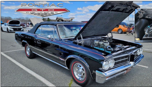
BEST OPEN CAR: 1964 Pontiac GTO Convertible