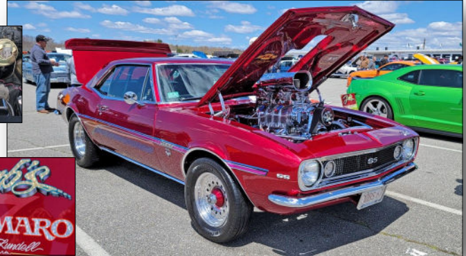
BEST CLOSED CAR: 1967 Camaro a.k.a "CHROMARO"