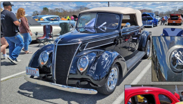
BEST PAINT: 1937 Ford Convertible