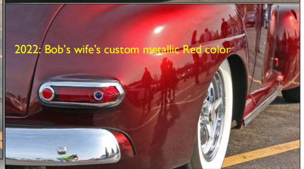
2022: Bob's wife's custom metallic Red color