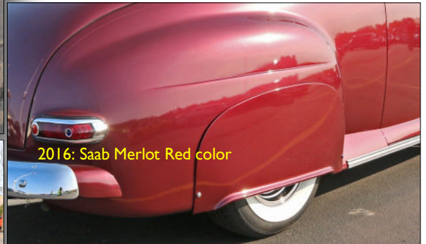
2016: Saab Merlot Red color