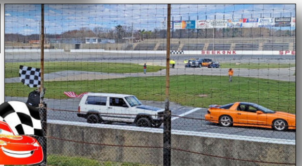
100 FT. DRAG WINNER: PONTIAC TRANS AM