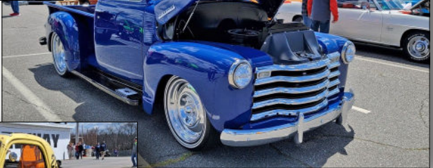
BEST TRUCK: 1951 Chevrolet Pickup