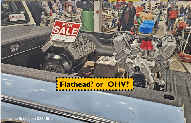
Flathead? or OHV?