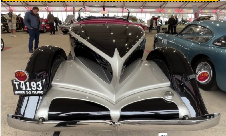
BELOW: Jerry Richmond's restored 1932 Auburn Boattail Speedster SOLD @ $297,000.