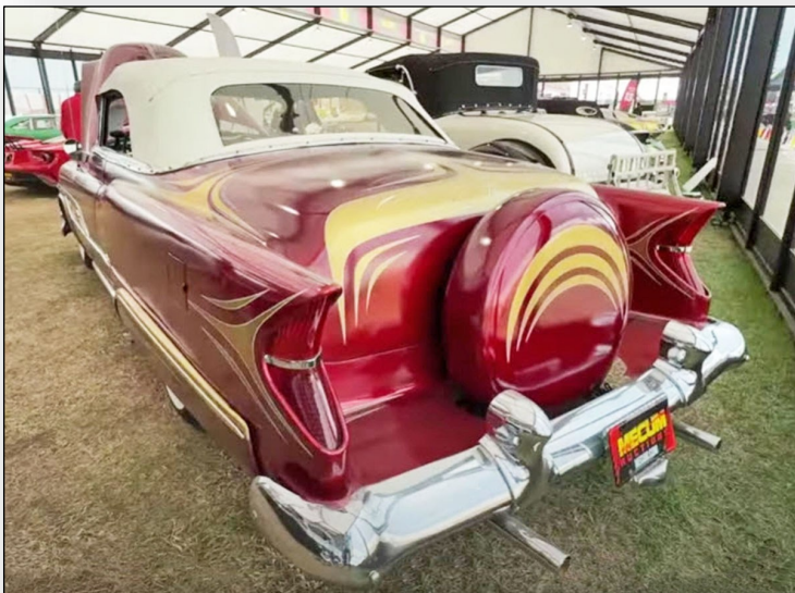
(ABOVE) Barris/Jeffries built, Foose restored 1953 Olds Custom Convertible SOLD @ $325,000.