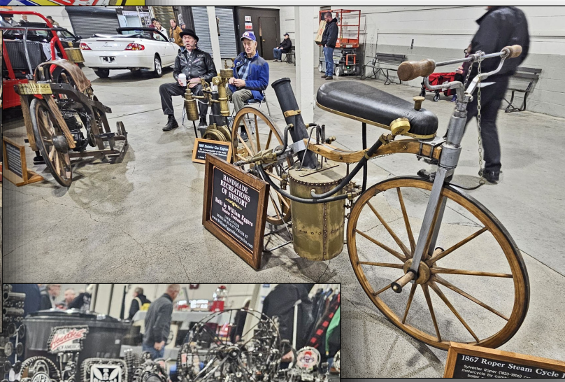
1867 Roper Steam Cycle B