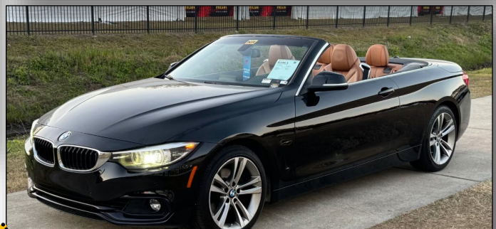
My favorite buy: 2018 BMX 430i SOLD @ $17,000