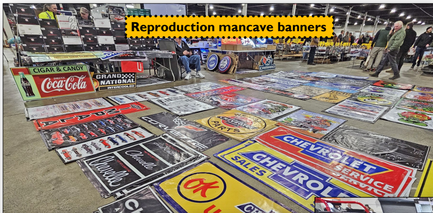
Reproduction mancave banners