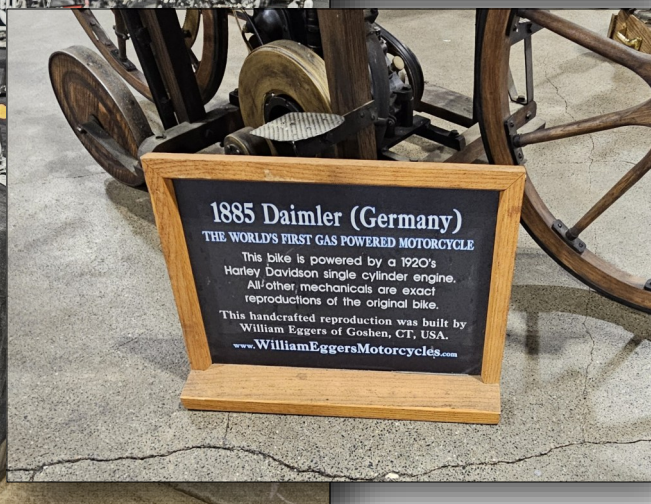
1885 Daimler (Germany) THE WORLD'S FIRST GAS POWERED MOTORCYCLE This bike is powered by a 1920's Harley Davidson single cylinder engine. All other mechanicals are exact reproductions of the original bike. This handcrafted reproduction was built by William Eggers of Goshen, CT, USA. www.WilliamEggersMotorcycles.com