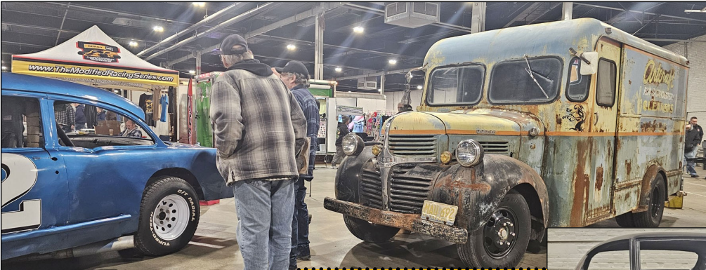
(above) 1939 Dodge 3/4 Ton Delivery Truck (right) 1970 GTO rolling chassis & body -$16K (below left) 1941 Ford Coupe—$24.5K (below right) 1955 Olds 88 -$49,995, WOW!