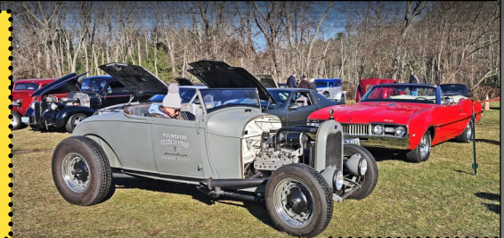
Loved seeing this old school Model A Roadster with hubby & wife bundled up to withstand the cold November morning.