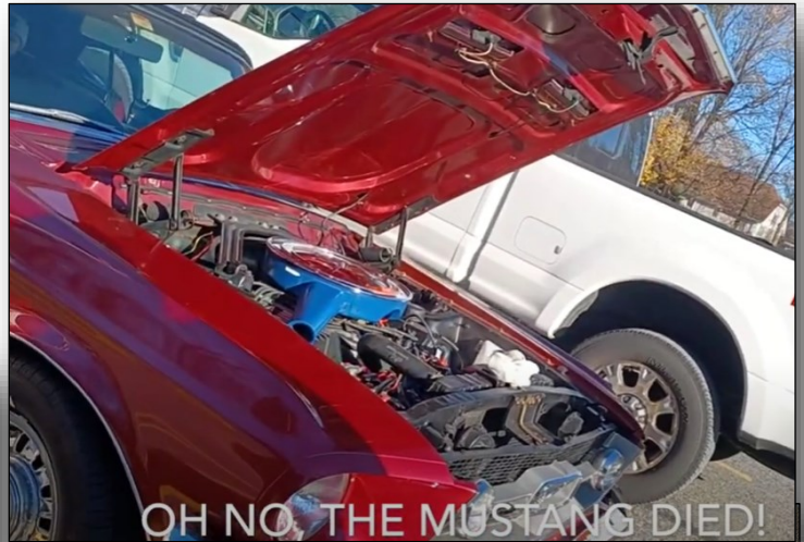
OH NO, THE MUSTANG DIED!