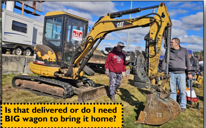
Is that delivered or do I need BIG wagon to bring it home?