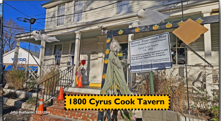
1800 Cyrus Cook Tavern