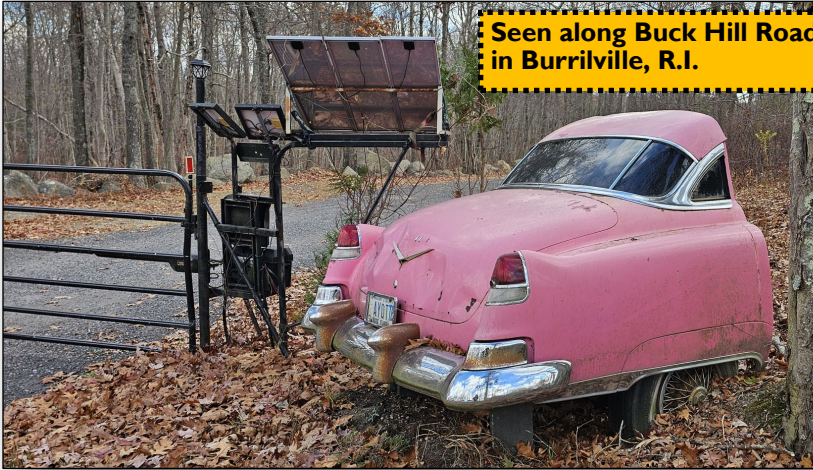
Seen along Buck Hill Road in Burrilville, R.I.

When the weather is perfect for my annual November Saturday morning cruise to the Thompson Speedway Flea Market & Swap Meet, it's also the perfect reason to drive the back roads through Rhode Island into Thompson, CT. This year's swap was packed with tire kickers like me this year. Vehicles for sale typically range from the usual race cars and project cars & trucks to a CAT 303 Excavator and ambulance this year. I brought my 3-wheel Lynx mobility scooter sporting a fresh new replacement battery that I used at Lake George this year to give it a flea market workout my body can no longer take walking all the rows. It allowed me the opportunity to collect and cart home a few light-weight flea market finds and the Lynx has now become my swap-meet buddy.