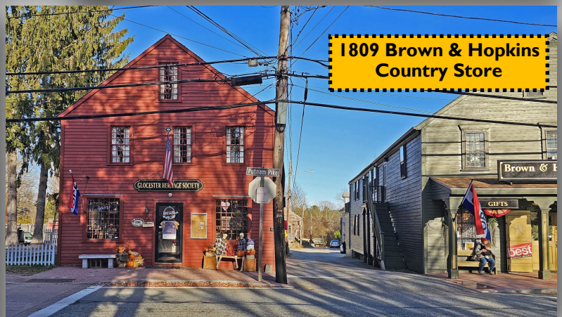
1809 Brown & Hopkins Country Store

Chepachet Village on U.S. Rte. 44 is a treasure trove of early 1800's buildings including the historic 1809 Brown & Hopkins Country Store and 1800 Cyrus Cook Tavern