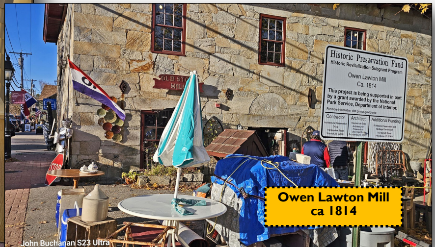
Owen Lawton Mill ca 1814

Chepachet Village on U.S. Rte. 44 is a treasure trove of early 1800's buildings including the historic 1809 Brown & Hopkins Country Store and 1800 Cyrus Cook Tavern