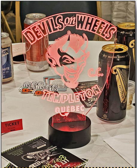
Devils on Wheels lited table centerpiece