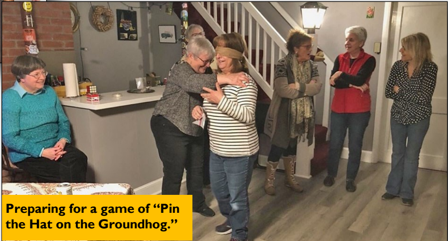
Preparing for a game of "Pin the Hat on the Groundhog."