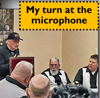
My turn at the microphone