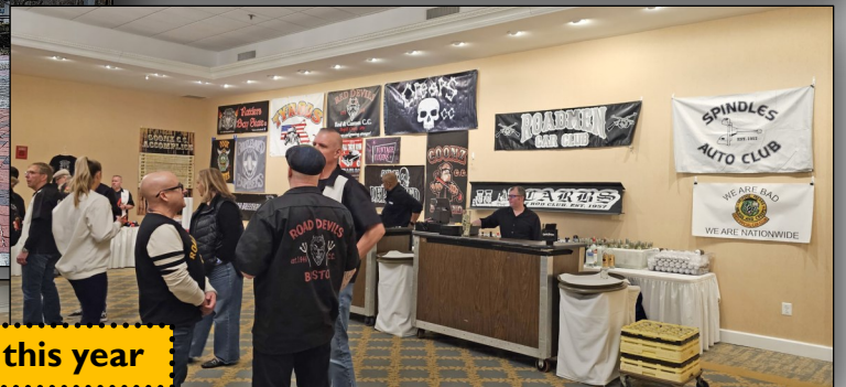
Over 300 hot rodders from 30 clubs attended this year