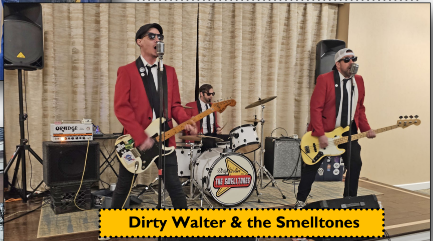
Dirty Walter & the Smelltones