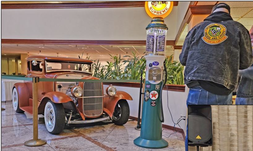
There's no confusion about who's in Westford this weekend.