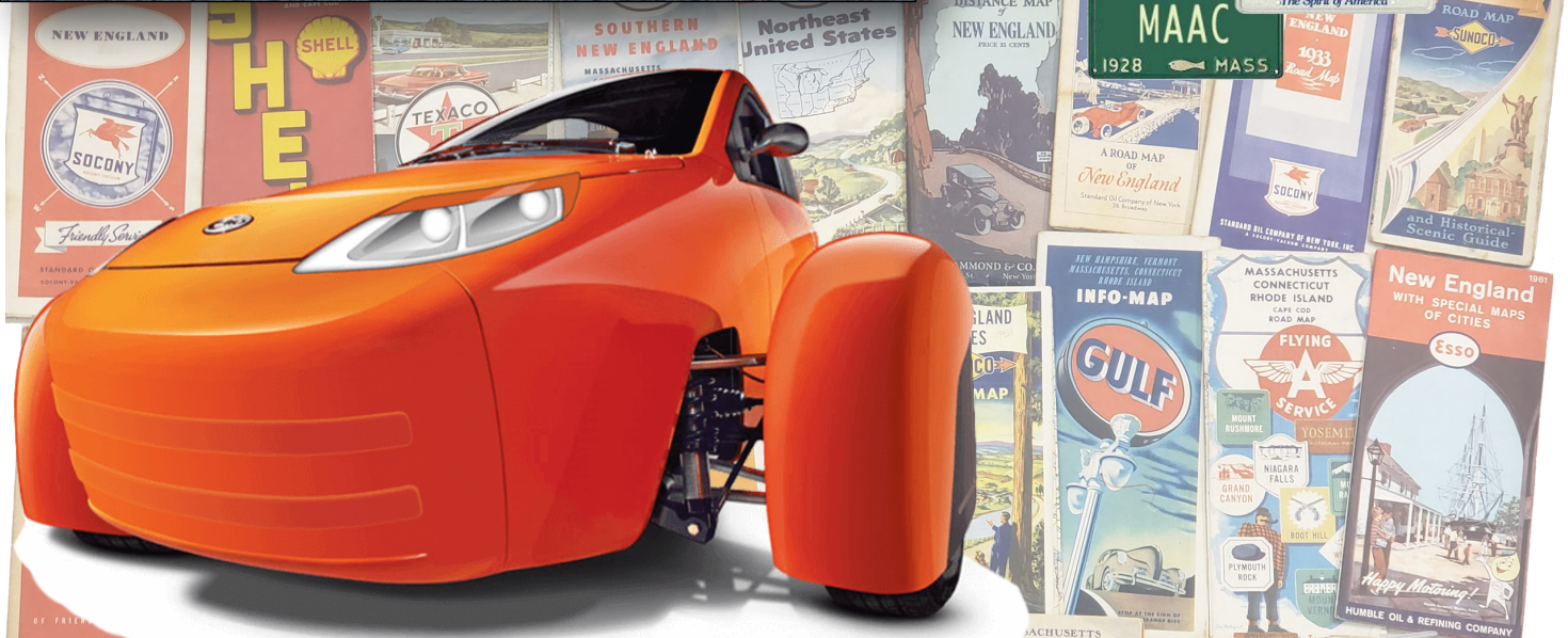
The ELIO Dream Lives On ??? page 10