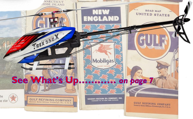
See What's Up..... on page 7