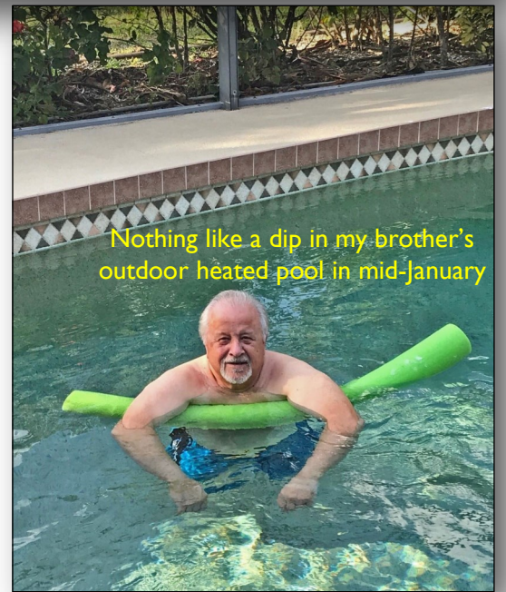
Nothing like a dip in my brother's outdoor heated pool in mid-January