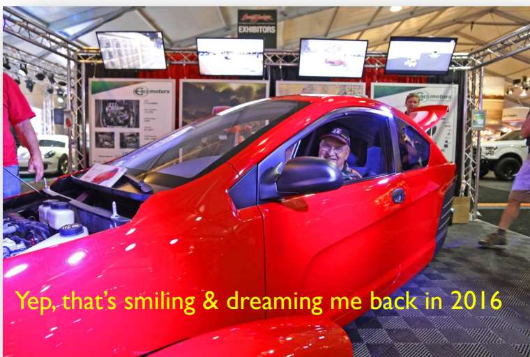
Yep, that's smiling & dreaming me back in 2016

FOOL ME ONCE, SHAME ON YOU. FOOL ME TWICE, SHAME ON ME