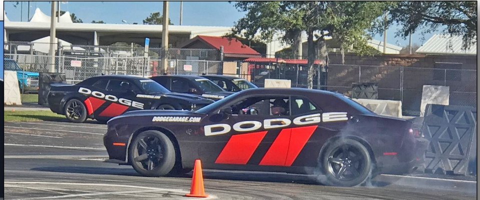
My Dodge Hellcat Thrill Ride at the Mecum Kissimmee Auction was...WHEEE