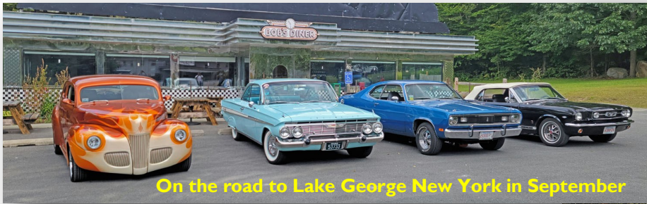
On the road to Lake George New York in September