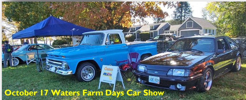
October 17 Waters Farm Days Car Show