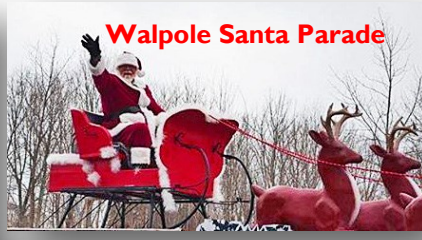
Walpole Santa Parade