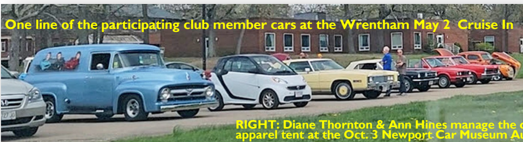
One line of the participating club member cars at the Wrentham May 2 Cruise In