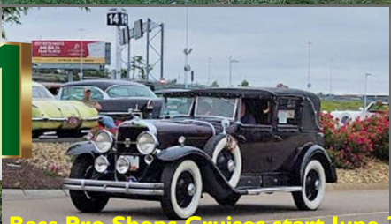
Bass Pro Shops Cruises start June 3