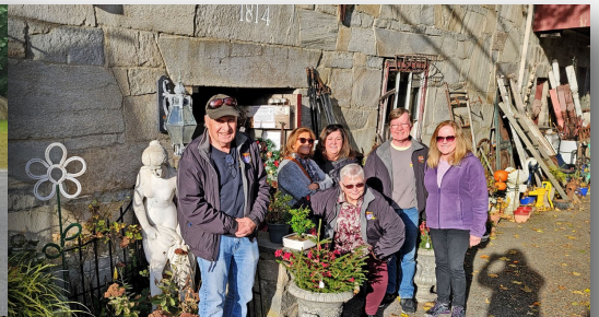
Wrights Farm Restaurant Gathering Cruise