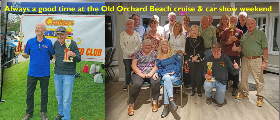
Always a good time at the Old Orchard Beach cruise & car show weekend