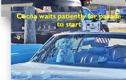
Cocoa waits patiently for parade to start