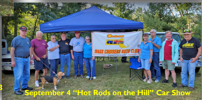
September 4 "Hot Rods on the Hill" Car Show