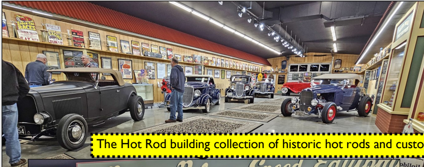
The Hot Rod building collection of historic hot rods and customs