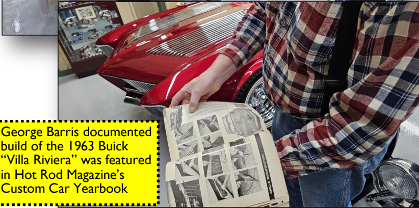
George Barris documented build of the 1963 Buick "Villa Riviera" was featured in Hot Rod Magazine's Custom Car Yearbook