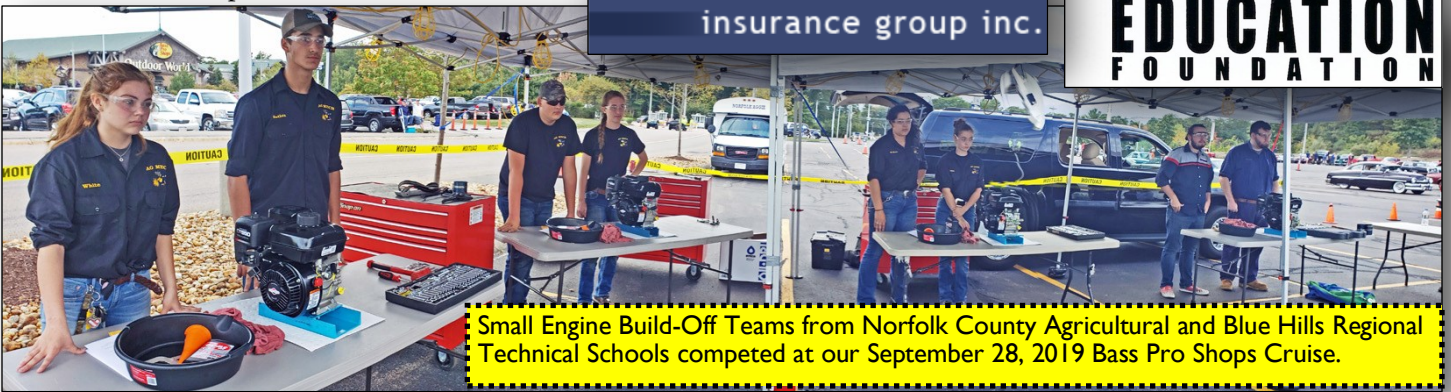
Small Engine Build-Off Teams from Norfolk County Agricultural and Blue Hills Regional Technical Schools competed at our September 28, 2019 Bass Pro Shops Cruise.