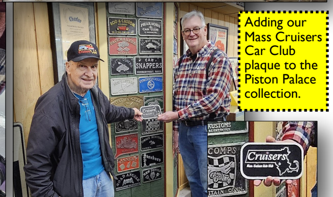
Adding our Mass Cruisers Car Club plaque to the Piston Palace collection.